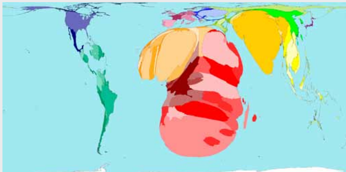
Figure 1. Prevalence of HIV (2004): Territory size shows the proportion of worldwide HIV prevalence.