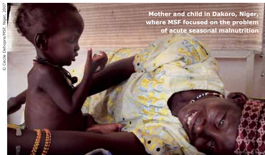
Mother and child in Dakoro, Niger, where MSF focused on the problem of acute seasonal malnutrition