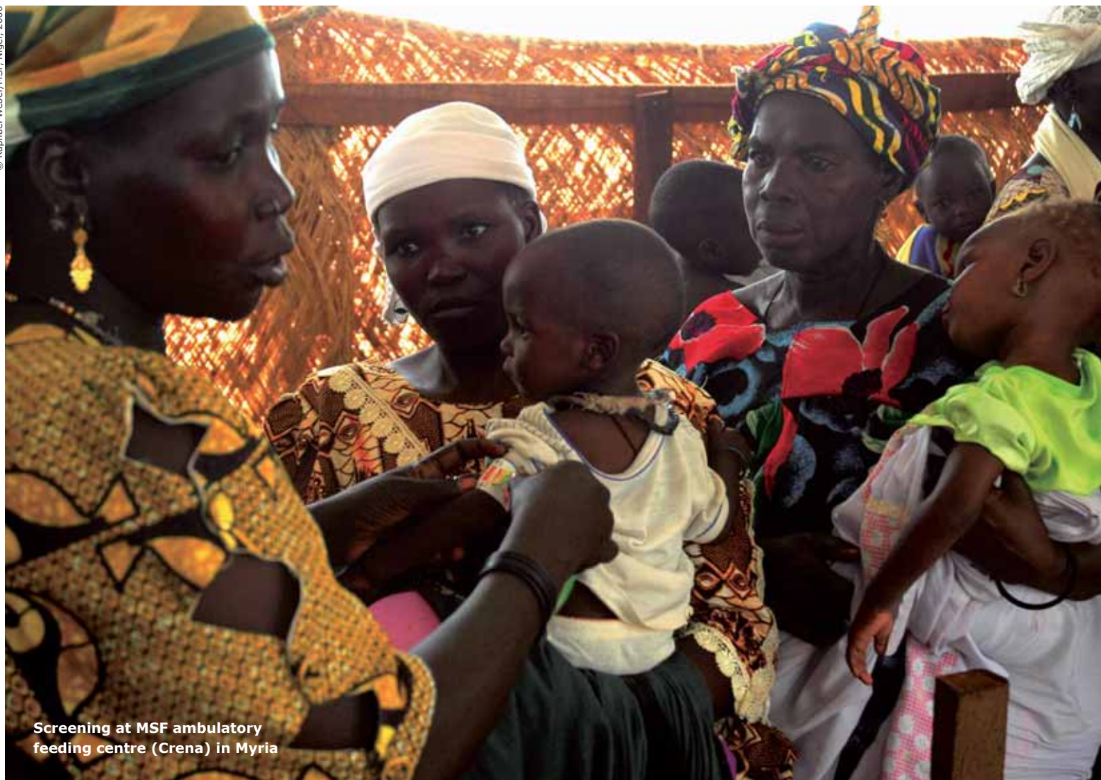
Screening at MSF ambulatory feeding centre (Crena) in Myria