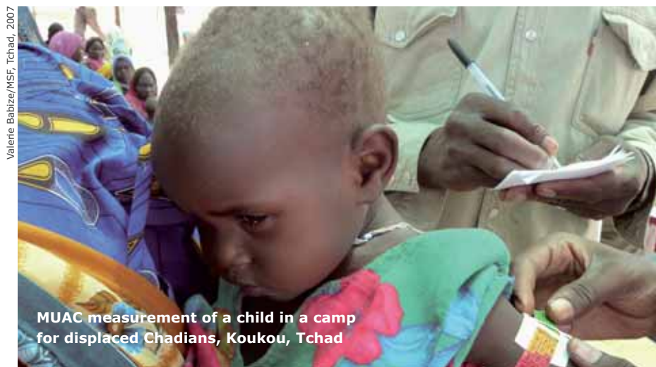
MUAC measurement of a child in a camp for displaced Chadians, Koukou, Tchad