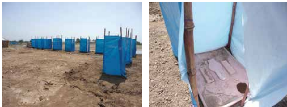
Newly built latrines in a small IDP camp near Jacobabad, Pakistan 2010. There is little privacy, no cleaning organized and as a result they were not used. Thousands of these types of latrines were built in the Sindh and Baluchistan provinces after the flooding disaster.

read a 200-page manual. Additionally, agencies often work with the staff they have or can hire in a short period of time, sometimes without any emergency WatSan experience. The pressure to complete activities in a short time, difficulties in finding qualified staff, and problems with funding or supply issues, can all result in what is frequently seen in emergencies: inadequate facilities set up, constructed without any input from the users, limited planning to clean or maintain the facilities, and inappropriate design for the needs of their users, especially women. Gender issues are regularly overlooked.