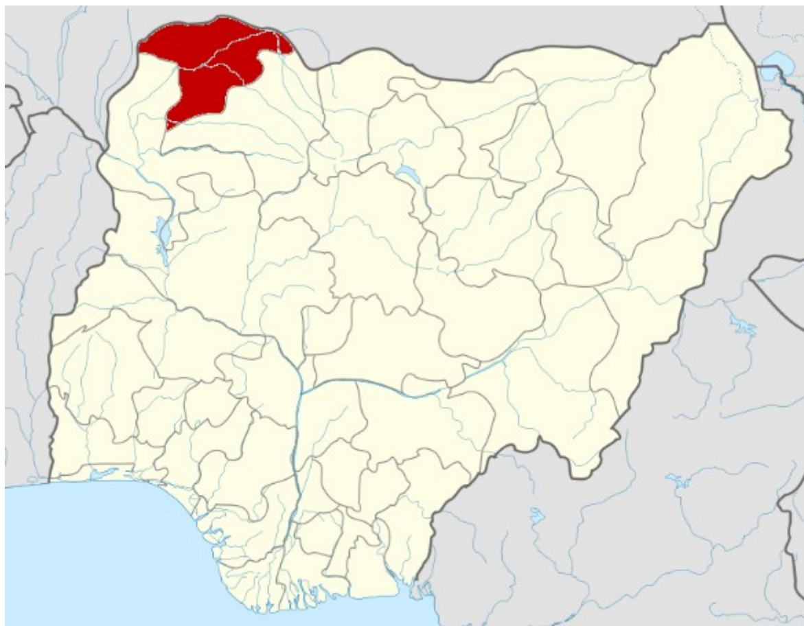
Figure 3: MSF Noma Childrens Hospital